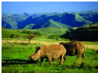
Hluhluwe Game Reserve