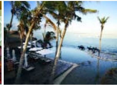
Far left: Medjumbe Island