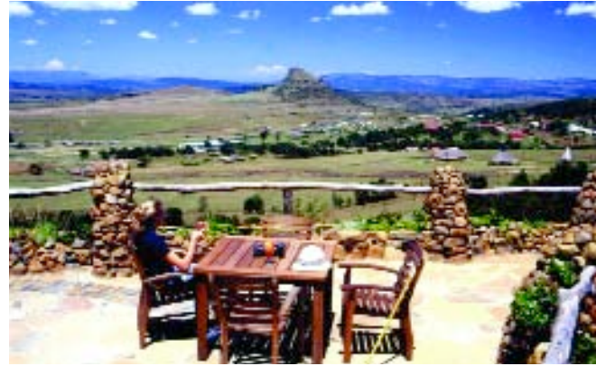
Clear skies at Isandlwana