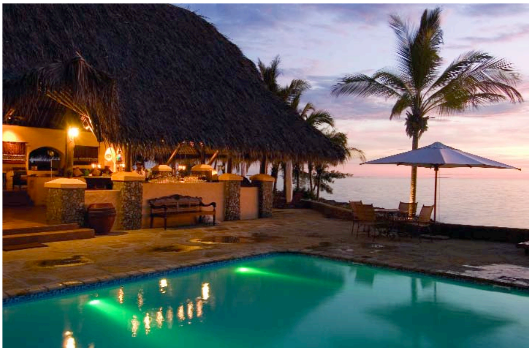
Below: Matemo Island's pool bar