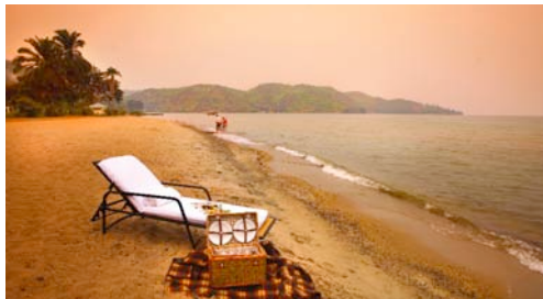
Above: Kigali Serena Hotel Left: Lake Kivu Serena Hotel

Serena now offer Rwanda as a destination in their impressive portfolio having taken over the Kigali InterContinental Hotel and Kivu Sun Hotel in February 2007. The renamed Kigali Serena Hotel is a 104-room five-star hotel based in the heart of the country's capital. Planned capital investment of US$ 9.5 million includes constructing 50 additional guest bedrooms, a modern health and fitness centre and general facility upgrade. The Lake Kivu Serena Hotel is a 72-room four-star property on the shores of Lake Kivu, ideally located for gorilla trekking. Lake Kivu Serena will be developed into a top quality spa facility maximizing its scenic lake side location.