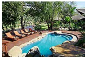
Relax at the pool