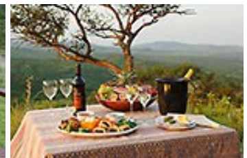
Romance in the bush