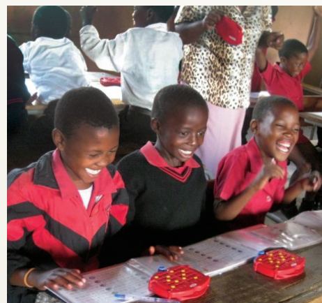
Edupeg learners at work